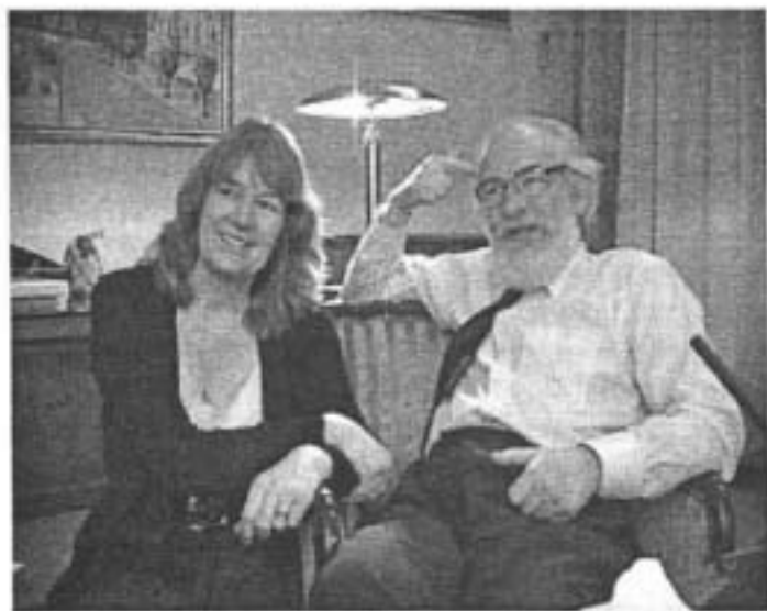
Hilary and David Crystal

So the quotations that stay in my mind most at the moment are the quotations to do with language endangerment and language death. And the one that now immediately comes into my mind is a quotation which is actually a translation from Welsh. In Welsh it is Cenedl heb iaith, cenedl heb galon , which means A nation without a language is a nation without a heart . You'll find a similar quotation in many other languages, too. But that summarizes so much about what it means to have a language and