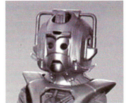
A cyberman from Dr Who.

ogy, ethnology, taxonomy, metabolism). You can trace the stops and starts in human intellectual progress through the pages of an etymological dictionary.