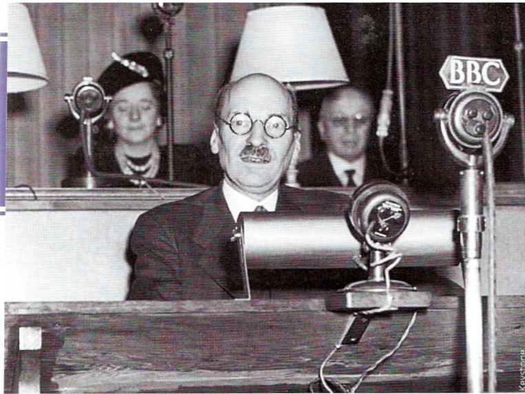
The voice of Britain: prime minister Clement Attlee during a BBC broadcast in 1945