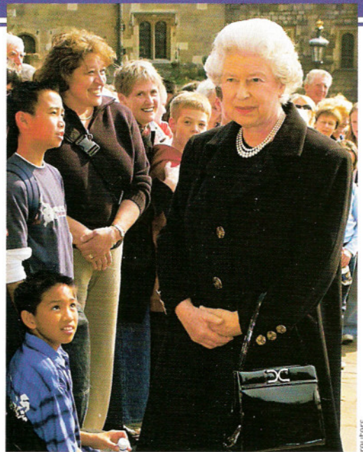
With the people: the queen's accent has changed slightly over the past 50 years

Zu Zeiten der Krönung, vor 50 Jahren, sprachen fünf Prozent der Bevölkerung “das Englisch der Königin” — heute kaum noch zwei Prozent. In einem Interview äußert sich David Crystal zur Geschichte und Zukunft dieser Sprache. medium