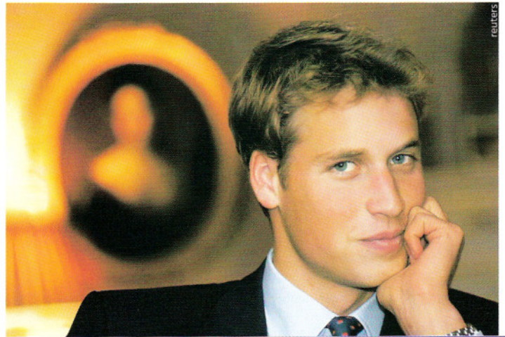
The future king: Prince William is beginning to use some of the features of common English

"William is more likely to use informal styles on public occasions"