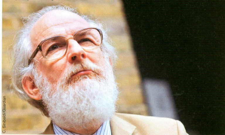
David Crystal: studying how language changes