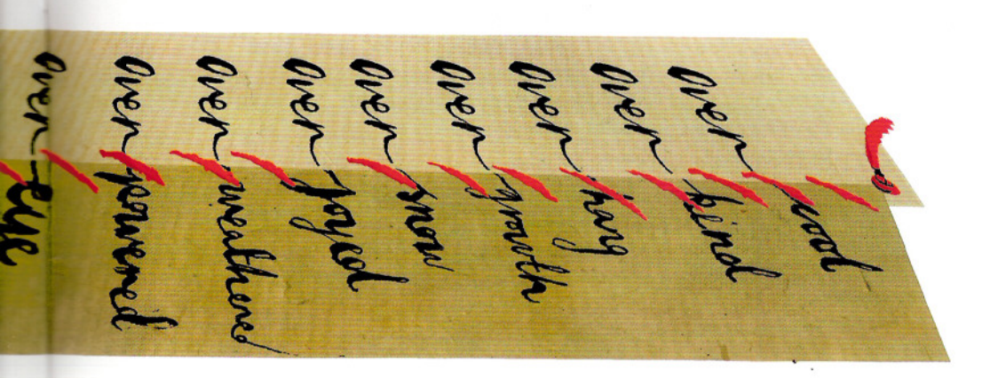
Illustration Belle Mellor www.bellemellor.com